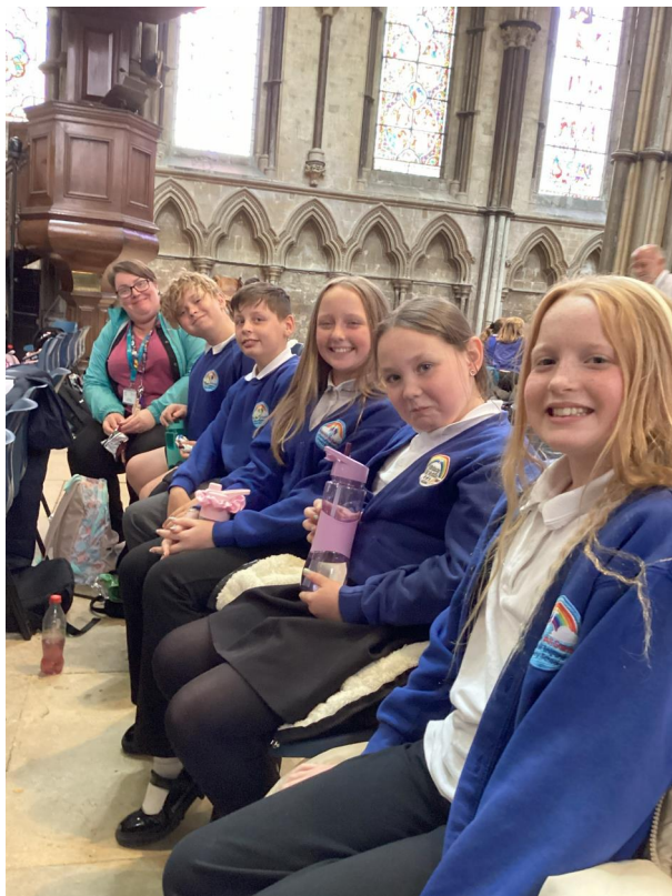
Y5/6 Farm School