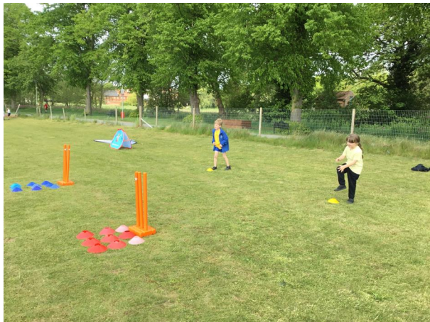
Y3/4 Foxes attended a cricket event