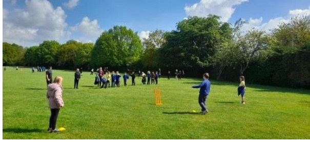
Y5/6 Badgers had a great day at Farm School