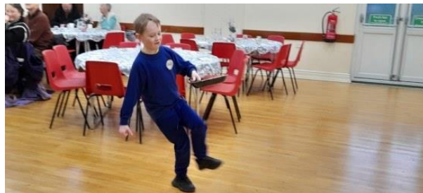
Class 1 & 2 were at the Farm this week.