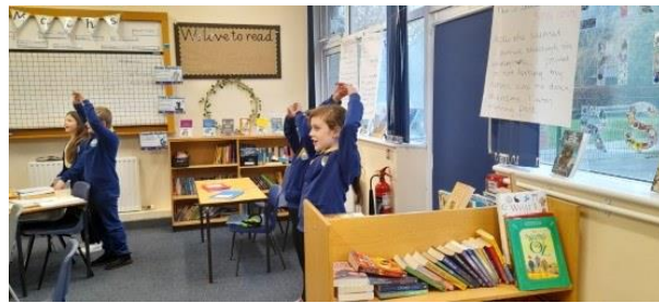
Sendhub adventures this week.