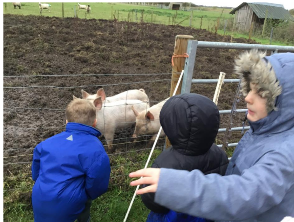
2 - Farm School