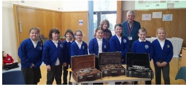
1 - Skegness Silver Band presenting instruments to the Brass Group.