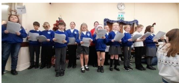
1 - The Choir singing at the Friskney Craft Fair