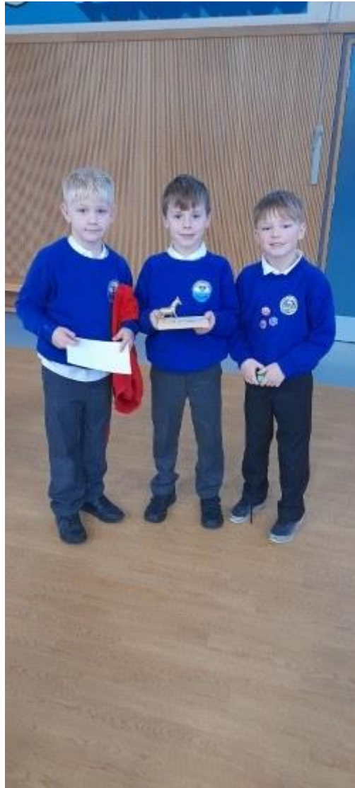
2 - The winning Farm School team this week